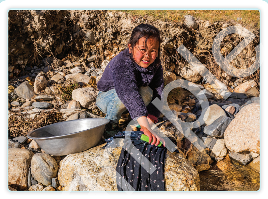
A girl cleans her clothes in a river.

Everyone around the world cleans their clothes. But the way they clean their clothes depends on their culture, where they live, and what supplies they have. Some people have washing machines at home that wash and dry their clothes.